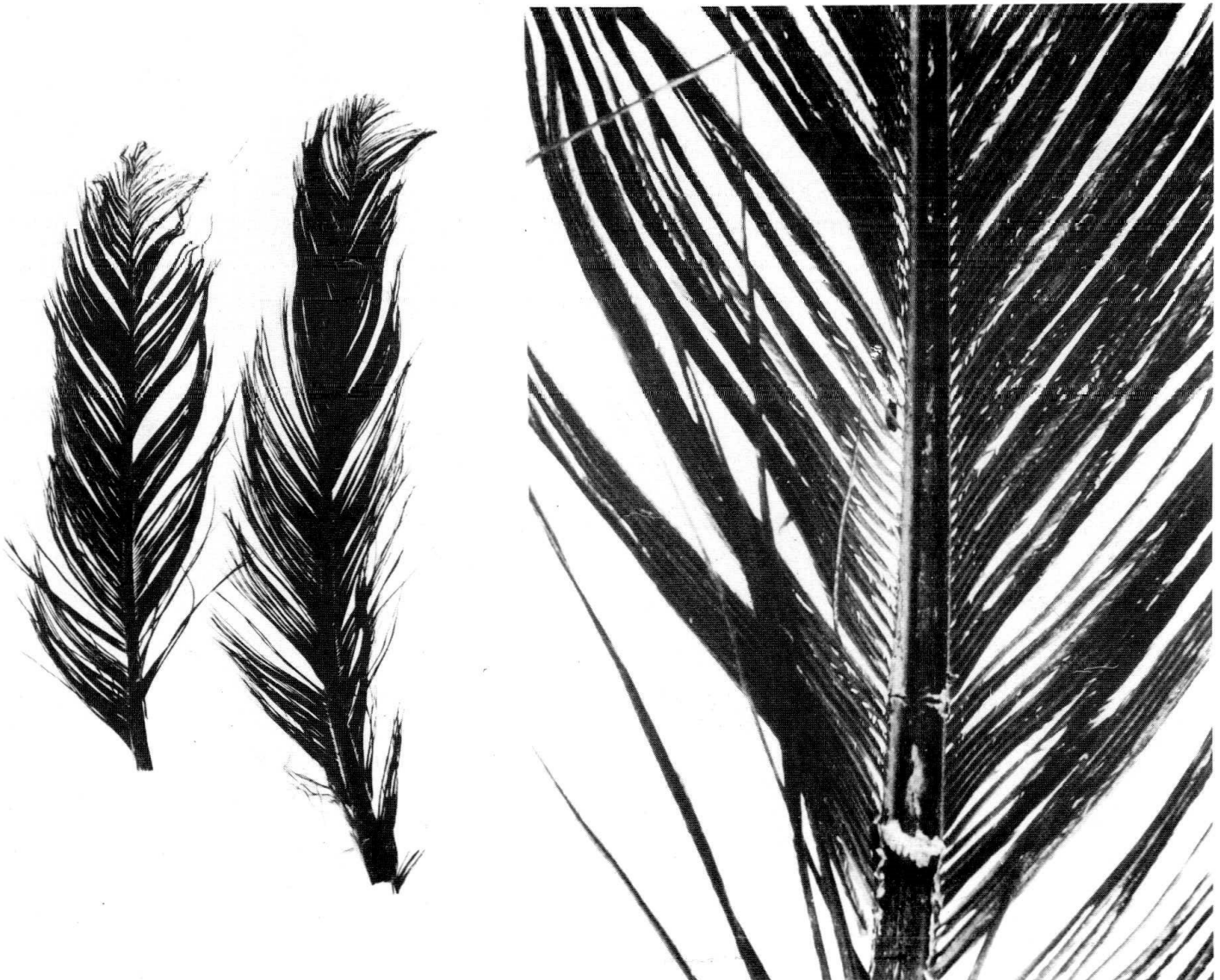
FIGURE 2 - Two of the 13th century tail feathers of a Rook or a Crow which were found to contain the remains of ectoparasites (left) and a detail of one of the feathers (right).

The feathers belonged to either a Rook ( Corvus frugilegus ) or a Crow ( Corvus corone ). Meticulous investigation of the feathers revealed the presence of the remains of a featherlouse ( Mallophaga ) and of feathermites ( Analgesidae ). Unfortunately, the state of conservation of the lice remains did not allow an identification to species level. If this had been possible, the identification could have provided an answer to the question on whether these feathers came from a Rook or from a Crow (Zeiler & Schelvis, 1991).